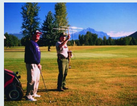
FIGURE 4 National Park ranger radiotracking a bear on golf course adjacent to Glacier National Park, Montana, USA. The bear is just out of sight of the photographer. Glacier National Park high country is in the background.