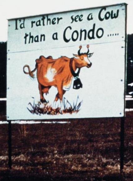
FIGURE 1 Sign close to a highway near Durango, CO. A condo is a condominium, ie, a common type of resort housing that is comprised of multiple-family attached dwellings purchased outright by their owners.

But perhaps even more debilitating are the impacts of development on human control of ecological processes. In pre-European times, forest fires in montane zones occurred with a return frequency of 40–80 years. Today, prime development is located on the forest fringe—homes nestled at the edge of the forest, great views overlooking valleys below, and private access to public land above. The result is that let-burn policies are challenged pragmatically because of the many homes and buildings at risk from forest fires. This occurs despite current public sentiment