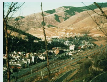
FIGURE 3 Vail valley, Colorado, USA. Valley bottoms are mostly privately owned, leaving them vulnerable to high-density development. Here, hotels and highways have squeezed the river and associated riparian zone up against the right side of the photograph, greatly reducing habitat for wildlife.

One example of an effort to inform local land use decision making of possible ecological impacts is the System for Conservation Planning, SCoP (pronounced “scope”). The goal of SCoP is to support local community planning in Colorado by providing readily accessible information on the consequences of development for