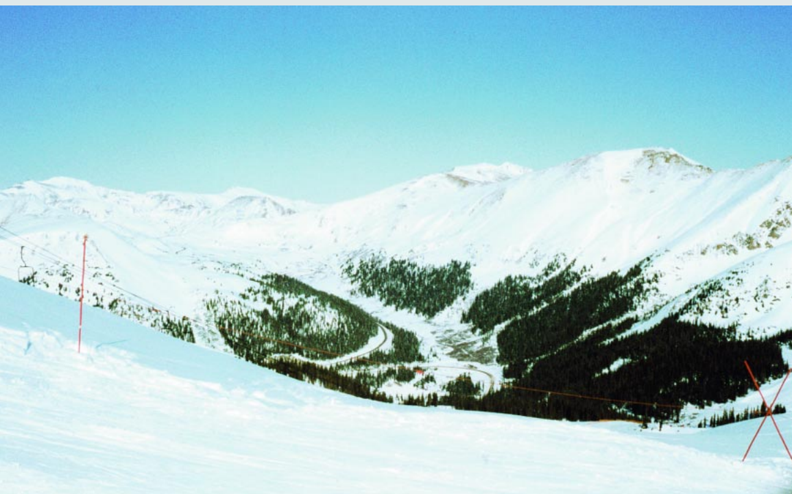
FIGURE 6 Arapaho Basin, Co. Most of the ski area lies above the timberline (3200 m asl) on state-owned land; the ski runs are privately operated under permit from the Forest Service. Natural snowfall is augmented out of season by snowmaking technology, which dewateres the streams during periods of low flow. This can be devastating to aquatic communities, creating yet another conflict among multiple users of mountain environments.

ensure that conserved areas are compactly shaped rather than dissected by fingers of development.